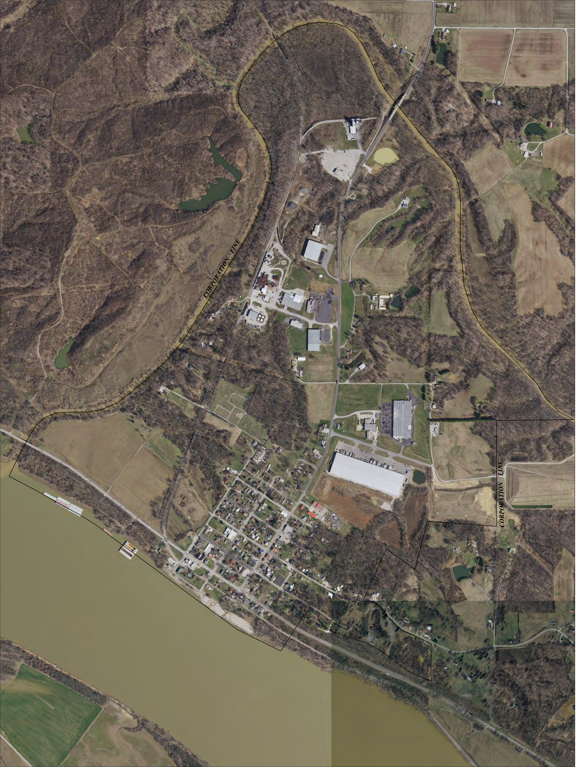
Aerial Photo Taken Spring 2020

The information located upon the Troy, Indiana Base Map is provided by Indiana 15 Regional Planning Commission. The data provided herein was compiled using various sources. The sources include: